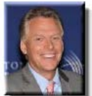
Gov. Terry McAuliffe

Cabinet secretaries and departments, agencies, commissions, and regulatory boards