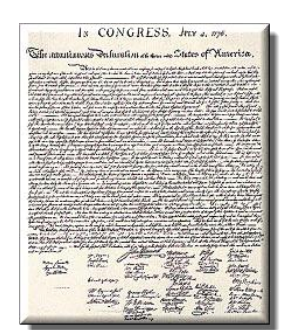
Declaration of Independence