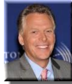
Gov. Terry McAuliffe

The roles and powers of the state executive branch and regulatory boards.