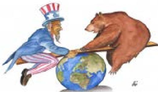
The Cold War