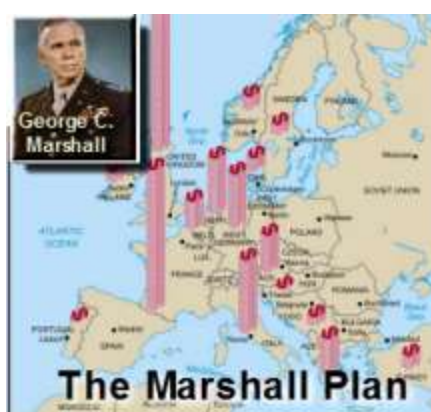
Provided U.S. aid to rebuild European countries that were destroyed by Germany during World War II.

People have moved to Virginia from many other states and nations.