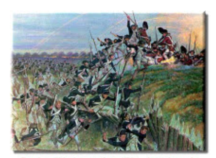
attle of Yorktown Oct. 1781- American & French troops storming British fort.

Varied roles of American Indians, whites, enslaved African Americans, and free African Americans in the Revolutionary War era