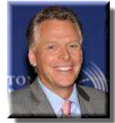
Gov. Terry McAuliffe