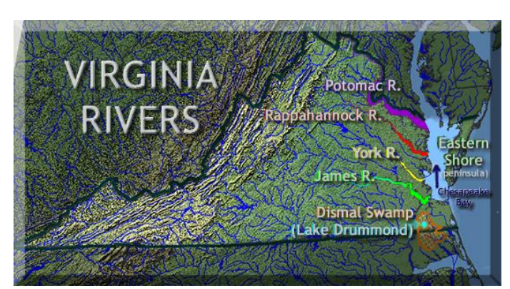
How did water features influence the development of Virginia? How did the flow of rivers affect the settlement of Virginia?