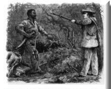
After leading a slave uprising, Nat Turner is captured