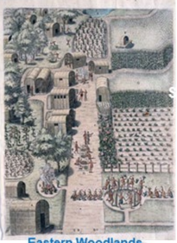
Eastern Woodlands Powhatan Village