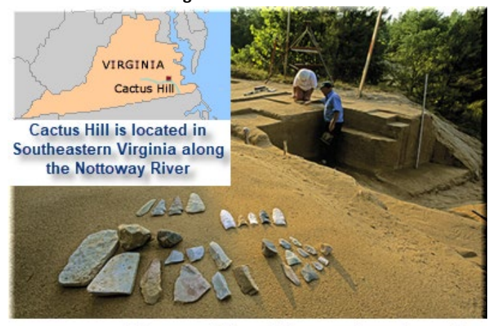
Cactus Hill is one of the oldest archaeological sites in North America

Evidence that humans lived at Cactus Hill as early as 18,000 years ago makes it one of the oldest archaeological sites in North America.